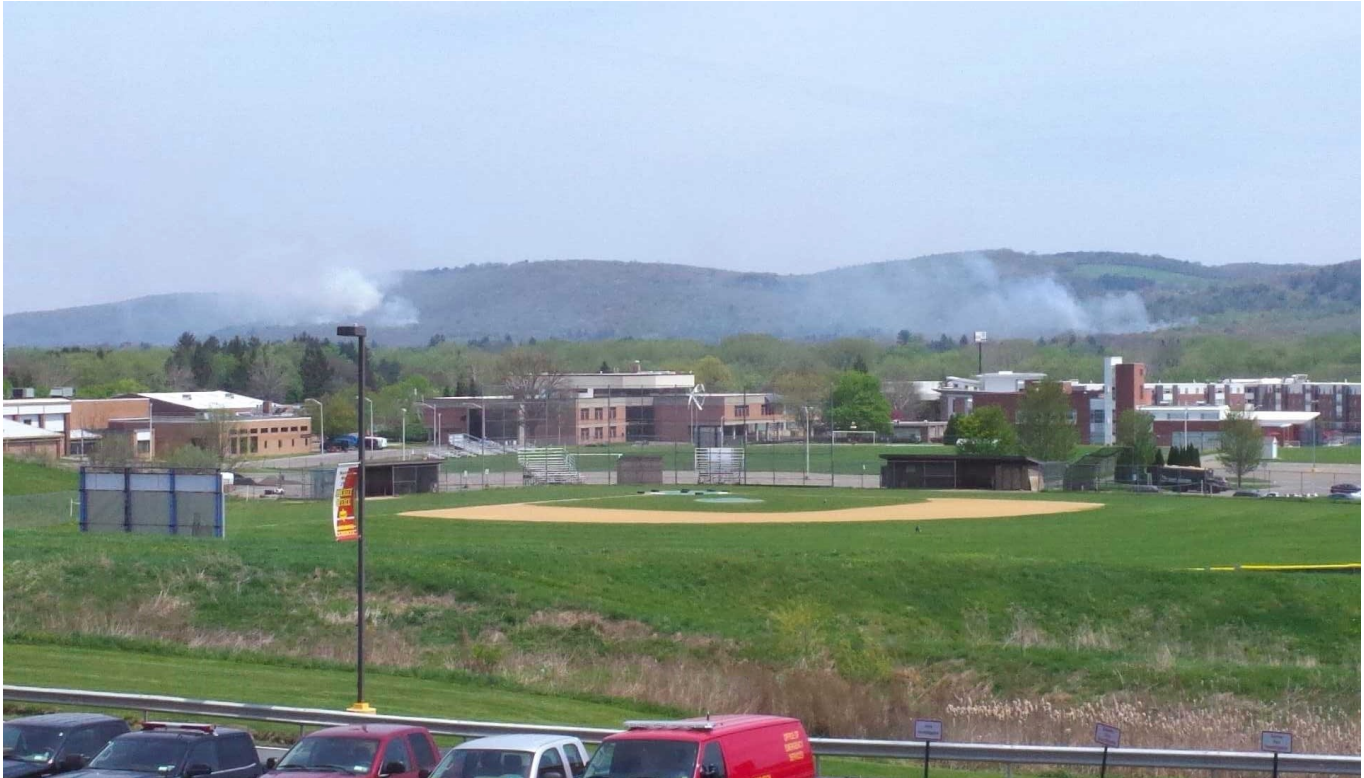
View from across the river at Emergency Services. The larger fire is on the left.

On Saturday May 9th, 2015, just after noon an eastbound train leaving Binghamton sparked multiple fires along the railroad tracks through Port Dickinson, Hillcrest, Port Crane, and Sanitaria Springs. Several departments were initially dispatched for spot fires along the tracks. Some fires were quickly extinguished while others were harder to access and due to hot, dry, and windy weather conditions and quickly grew out of control.