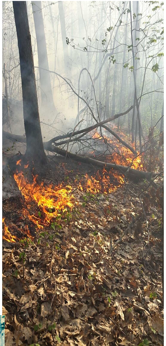
Fire quickly spreading east through the woods.

Broome County Fire Coordinators established a Command Post at the Chenango valley High School. All units were staged at this location and then deployed from there. A landing zone for the helicopter was also set up at this location. A tanker shuttle was set up from Nowlan Road to Prentice Hill and continued through the incident. The fire was finally ruled 100% contained about 19:30 hours and the last crews exited the woods around 21:00. Several departments returned both Sunday and Monday to finish extinguishing hot spots within the burned out area.