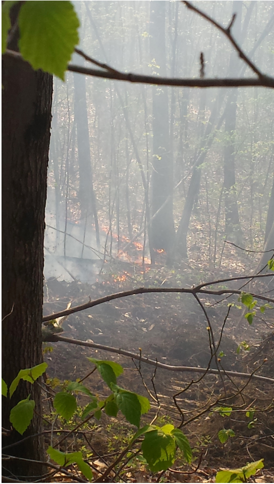
Fire spreads east towards the fire break cut by one of the bulldozers.