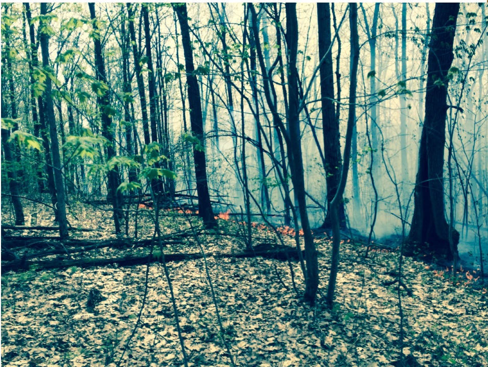
Fire advances uphill towards the houses.