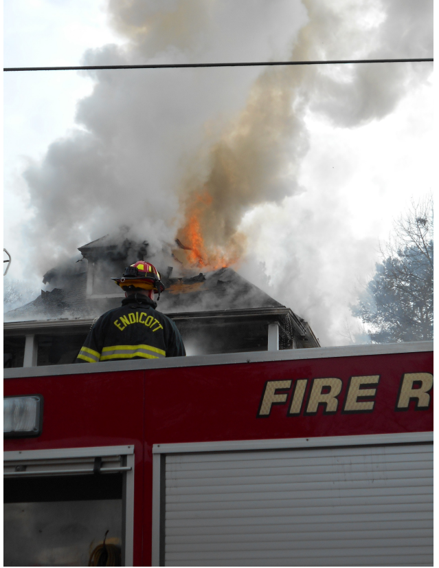
Master streams are used to try and contain the fire.

On the 2nd alarm, a total recall of Endicott Fire off duty, Endwell Fire for an Engine 31-1, Vestal Fire for Tower 32-1, Union Center Fire for Rescue 53, and West Corners Fire for a FAST Team were all dispatched. West Endicott Fire was also placed on standby along with Campville Fire and Vestal Fire's other stations.