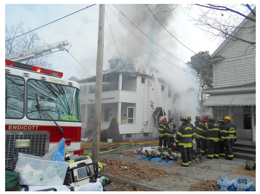
Overhaul continues in an attempt to douse hot spots