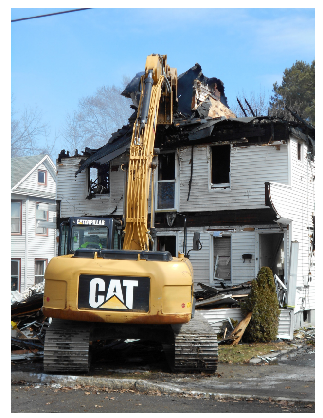
The excavator removes a portion of the attic in an attempt to make the structure safer.