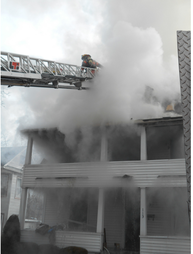
Ladder 32-4 trains its master stream on the attic.

Firefighters continued to flow water for several hours before the decision was made to bring in an excavator to help tear down parts of the structure in order to make it safe for operations to continue. DPW brought in their trackhoe and were directed to remove the porch and roof from the front of the structure. They also then removed some portions of the attic that were hanging near the front of the structure.