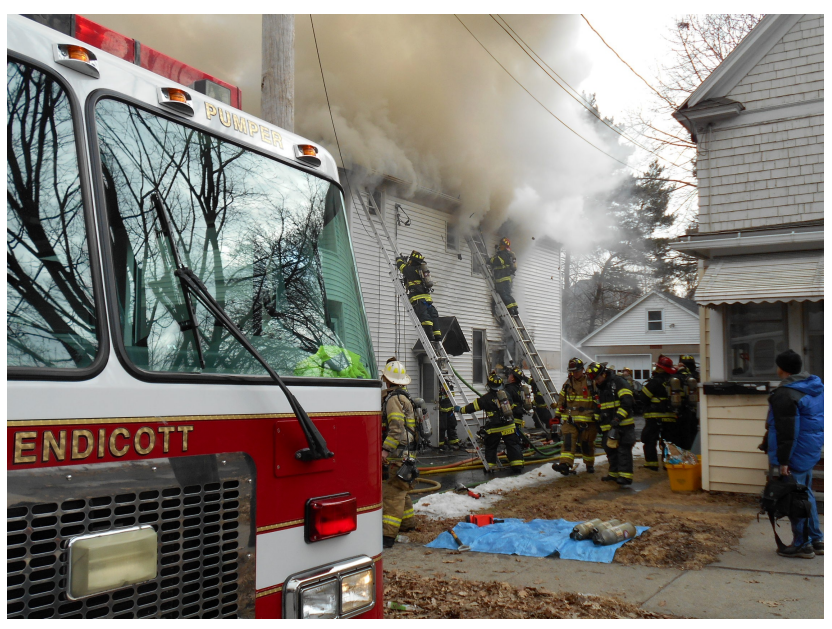
Firefighters vent second floor windows as others try to contain the fire.

Engine 25-1, Squad 25, and Chief 25 all responded with a total of 6 personnel. Chief 25 arrived and reported heavy smoke showing from a two and a half story wood frame residence and requested a 2nd alarm.