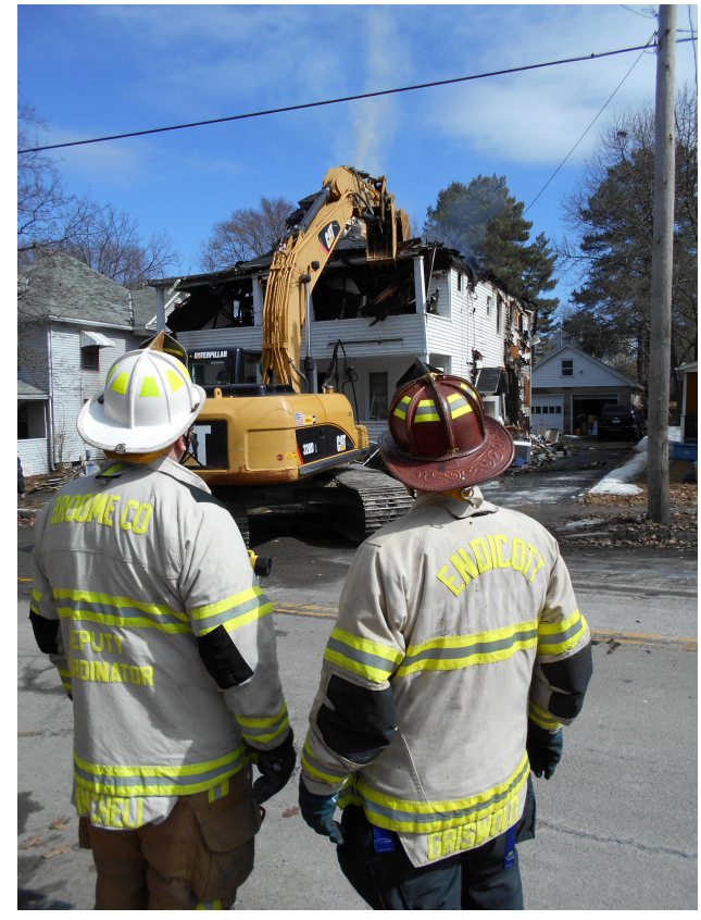
Command directs the excavator to tear the porch off the structure.