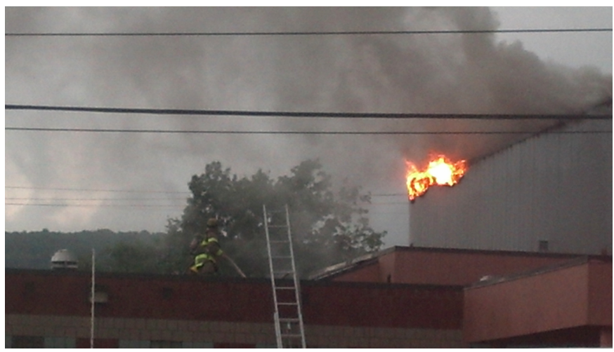
arrival from the exterior Firefighters stretch a line to the roof.

extension and begin overhaul. Extensive overhaul operations were conducted completely removing the metal siding from the tower section of the building.