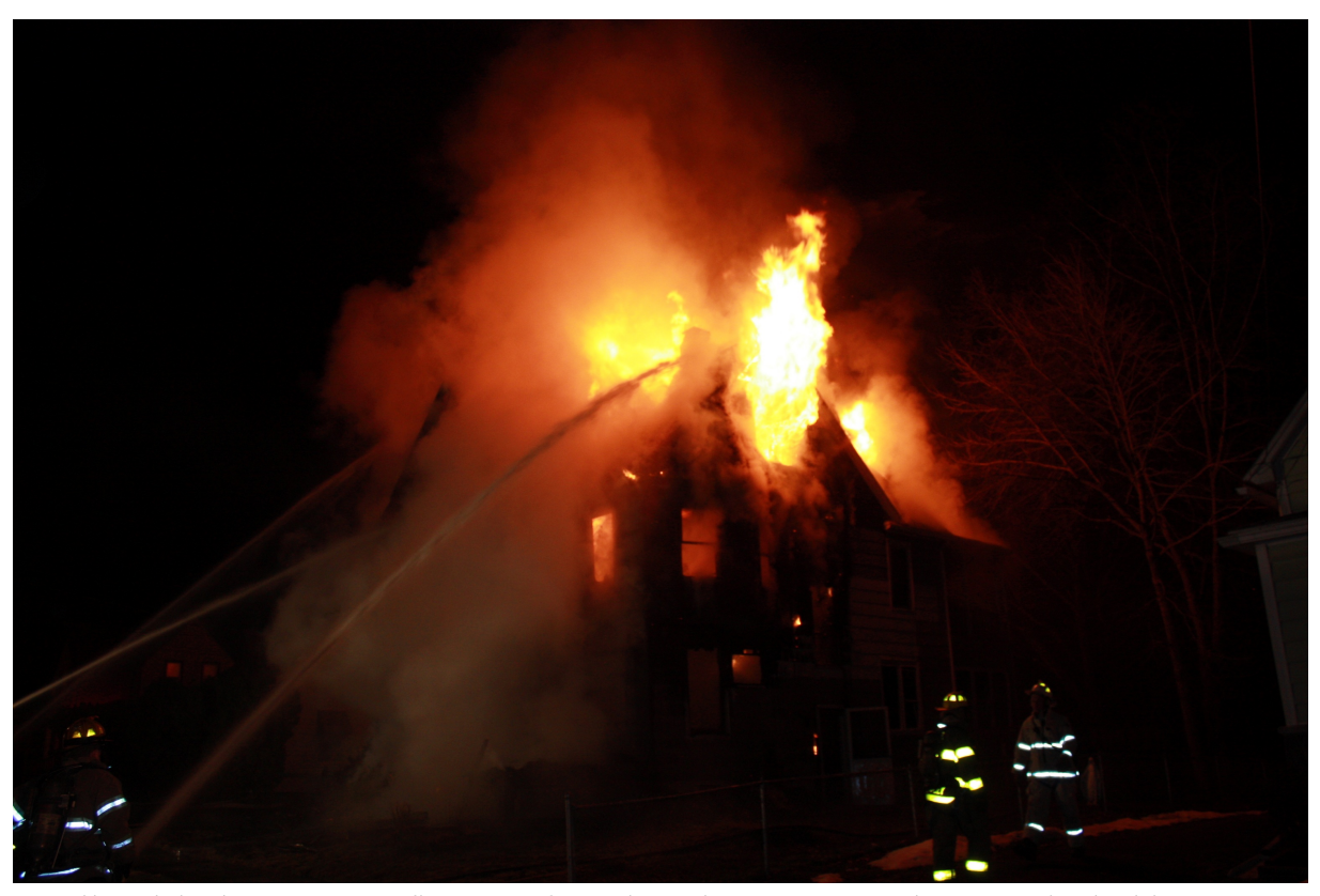
Heavy fire vents from the attic as crews work to contain the blaze.

Initial reports have listed both the Milford Street and Gaylord Street fires as suspicious and investigations are ongoing through the City of Binghamton Fire Marshal's office. Due to the fatality at the Milford Street fire the case is also being treated as a homicide investigation by the City of Binghamton Police Department. On another note Binghamton's east side and Engine 4 have been very busy over the last week having responded to two other unrelated fires including a natural gas explosion that severely damaged and blew the roof off a house only a few doors away at 31 Milford Street as well as another working house fire a few blocks north on Bingham Street.