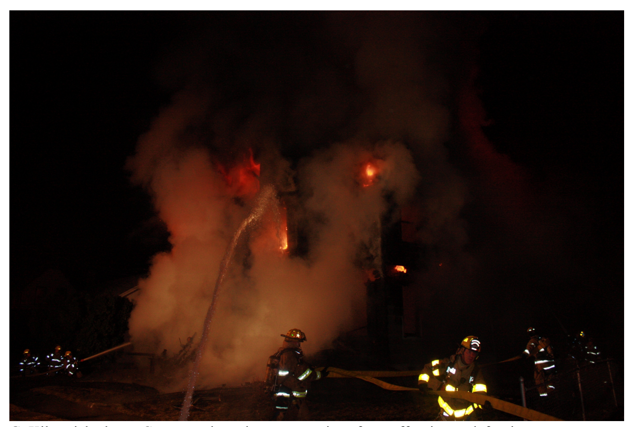
Crews work to change operations from offensive to defensive.

At this point crews did a PAR check to make sure all personnel were accounted for and quickly changed operations to a defensive attack. Reports from family members that were in the residence at the time of the fire were now confirming that one member of the family was still unaccounted for. Several family members were taken to local hospitals after they barely escaped the fire by way of the rear porch area of the house with the help of neighbors, a neighbor's ladder, and City of Binghamton police.