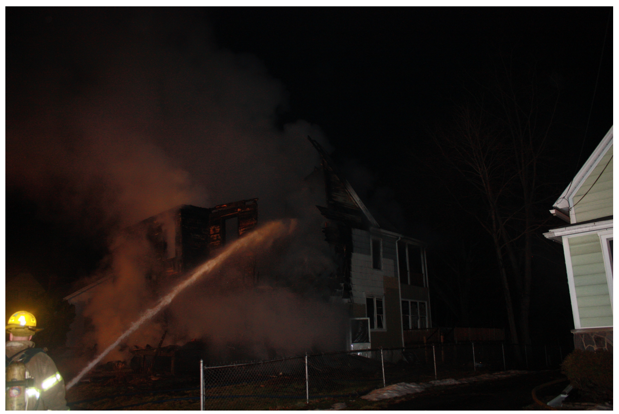
Very little is left of the front portion of the residence as crews continue to flow water.