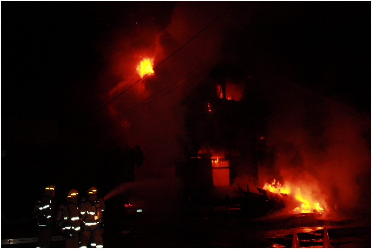
A crew works to extinguish the fire from side A.