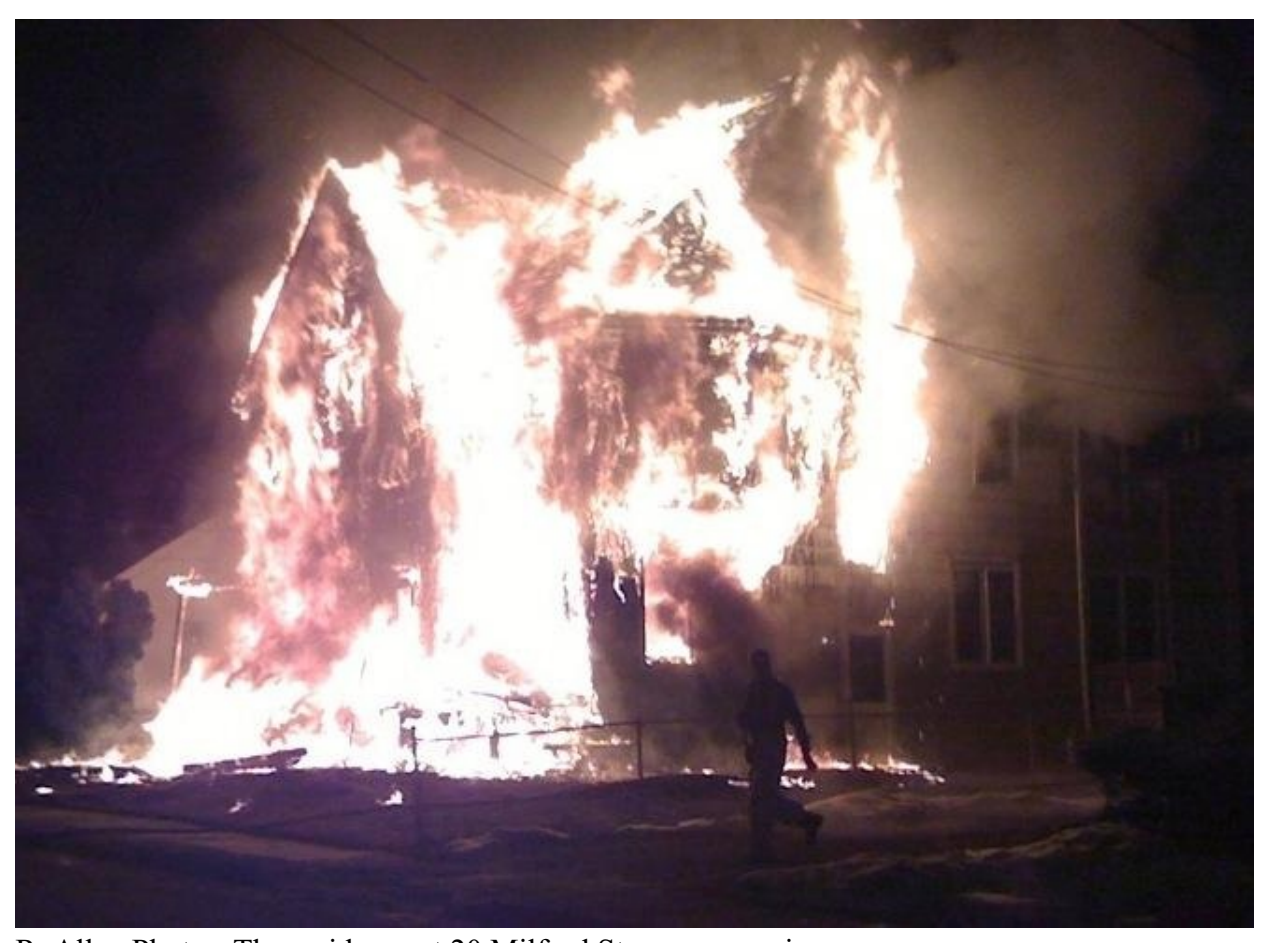
The residence at 20 Milford St as crews arrive on scene.

At 03:28 hours on the morning of Thursday, March 17, 2011, the tones rang in the City of Binghamton for a reported house fire at 20 Milford Street on the city's East Side. Upon arrival crews were met with a two and a half story, wood frame, single family dwelling with significant fire involvement on the outside front half of the house and extension into the inside. Crews were also faced with reports of people trapped in the residence. Due to these circumstances the duty chief in Car 21 immediately requested the 2nd alarm be struck.