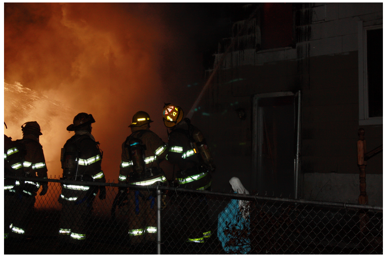
A crew works on side D in an attempt to keep the fire in the front portion of the structure.