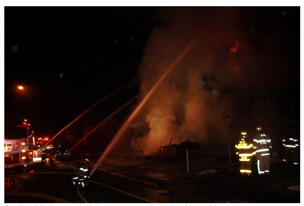
Multiple hose streams are directed at side A of the structure.