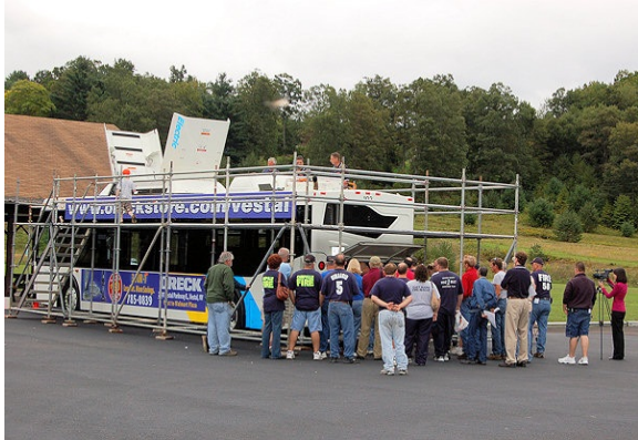
BAE hybrid bus presentation at Fire Expo 2009

Plans are coming together for the Broome County Expo 2010. BAE has announced that they will again have the hybrid bus presentation.